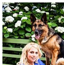
Mom Poses With Her Dog, But Wait Till You See What's In Her... Fuzzfix