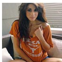
College Footballs Finest Fans Are Back For Another Season ViralBoom