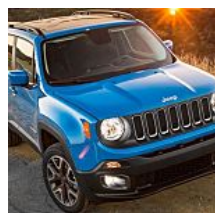
The 10 Best Cars for Under $25k Kelley Blue Book