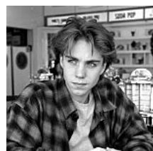
Celebs you didn't know passed away: #17 is Shocking Your Daily Dish